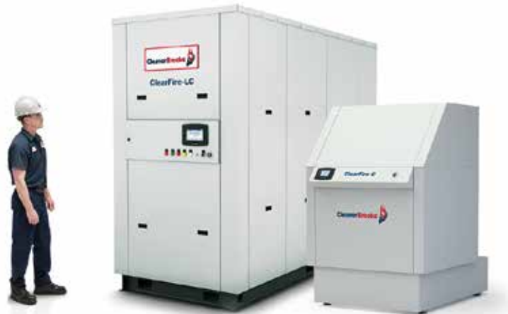
There is a hydronic boiler solution for almost any commercial application.

To locate a representative, visit cleaverbrooks.com or call (800) 250-5883.