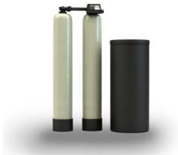
Water softeners remove harmful minerals that can cause scale buildup in your boiler.

Perhaps the most important piece of water treatment equipment is a water softener, which ensures good boiler water quality. Water softeners use a process called ion exchange to remove calcium and magnesium from the water. The hardness minerals are replaced with a highly soluble sodium or potassium ion that will not cause scale buildup, helping a boiler maintain efficiency throughout its life.