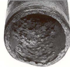
Untreated water can lead to corrosion of boiler internals and piping.

Boiler feedwater also contains metal salts such as chlorides, magnesium, sulphur and calcium bicarbonates. All of these salts combine to form what is known as the “hardness” of water, with calcium and magnesium contributing the most to water hardness. If deposits of calcium and magnesium are not removed from boiler feedwater, they will coat heating surfaces and eventually plug pipes and boiler tubes. Over time, the flow through a 1½” boiler tube may be restricted to only ½” due to blockage caused by calcium and magnesium deposits or scale.